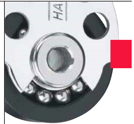
Hardened stainless steel inner race for maximum strength-to-weight ratio.

Dinghy control lines Spinnaker pole trip lines Big Boat leech lines Outhauls Downhauls Cunninghams Traveler controls Halyards on prams