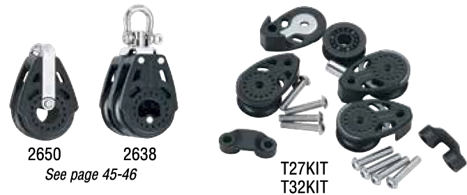
2650 2638 See page 45-46