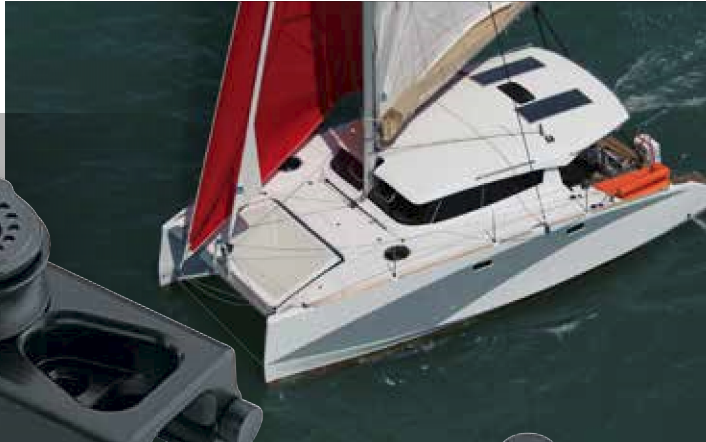
Aventura 33, 10.06 m (33'), Aventura Catamarans

About Carbo ball bearing or ESP sleeve bearing end controls: see feature pages at beginning of this section.