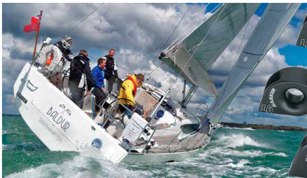
Baldur, Maxi 1200, 12.16 m (39.9'), Maxi Yachts, Delphia Yachts KOT, naval architect: Pelle Petterson