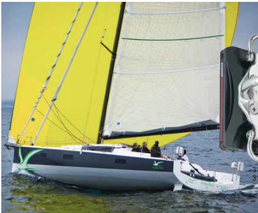
Pogo 50, 15.2 m (50'), Structures, Finot-Contq