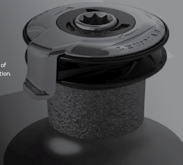
Dimensions Diagram EVO® Self-Tailing Winch